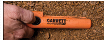
Fast Retune feature quickly tunes out mineralized ground, saltwater, wet sand, and other challenging environments.

If necessary, repeat this Fast Retune to further eliminate any environmental response. Note: An alternate means of eliminating the ground response is to reduce Sensitivity.